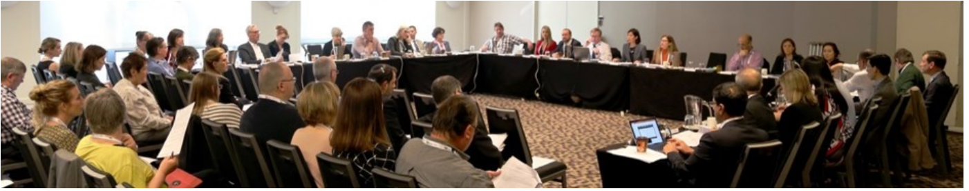
Open SAC Meeting